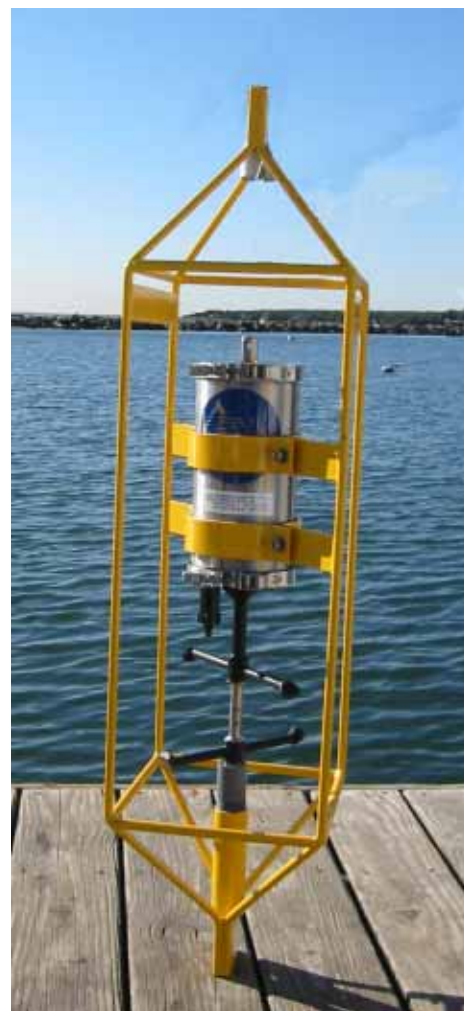
3D ACM with optional 3 ton frame